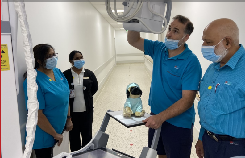
Some of our radiographers testing out the new equipment on Scrubs the Pug – no breaks found!

THANK YOU FOR YOUR PATIENCE AS WE BUILD THE LIVERPOOL HEALTH AND ACADEMIC PRECINCT