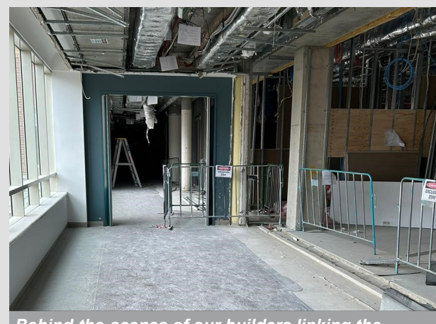
Behind-the-scenes of our builders linking the current building with the new hospital building.

To find out if this will affect you, please visit our Precinct Updates page.