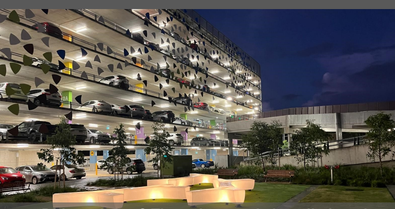
Did you know? The solar panels installed on the new car park provide on average, enough electricity to power approximately 100 houses per day.